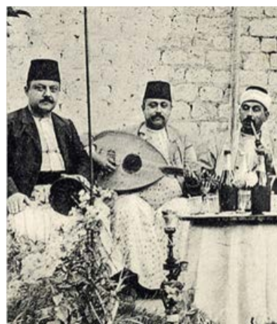
Syrian musicians in Aleppo with an oud, circa 1925

This incredible instrument has a deep resonant sound. An oud is fretless, allowing the musicians to bend and slide notes, and add vibrato to enrich its voice; and when played by a master such as Tawadros we were treated to a magical concert.