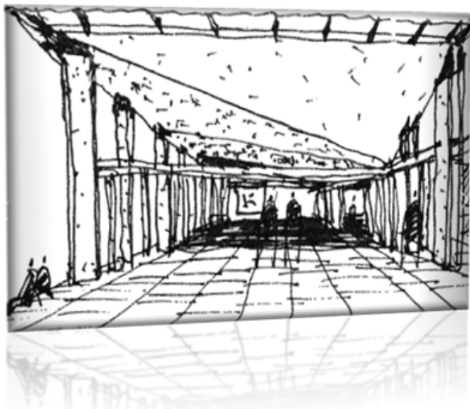
The Arthur & Yvonne Boyd Education Centre

We listened enchanted inside the multi award winning building, opened wide along the eastern wall showcasing the magnificent panorama below.